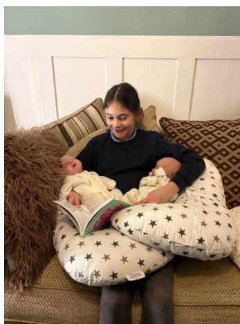
Phase 2 – Halle