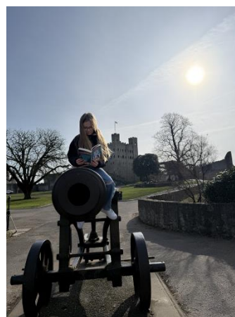
Phase 3 – Poppy

The Book Swap also proved to be very popular again during Reading Week. We plan on running this at least once a term as it is a great way to pass on old books and to get something new to read.