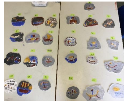
Our brilliant rune stones!

We have also been making Viking themed models in DT this term. We first planned and created a Viking rune stone using runes from the Futhark (Norse Alphabet). We made them using air-drying clay, carved them with a toothpick and then painted using classic Viking colours. They looked amazing!